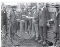
Workers, Politics and Labour Relations in Independent Ireland, 1922-46

“ Workers, Politics and Labour Relations in Independent Ireland, 1922-46 ” by Gerard Hanley and published by Four Courts Press in January 2024 (ISBN: 978-1-801151-078-3 : H/bk : 240pp : Price €45.00 : Web-Price €40.50) is essential reading for those with ancestral connections to the labour movement in Ireland and, of course, for the social historian and local historian seeking to understand the wider context, in which, national and local industrial disputes occurred and the political response.