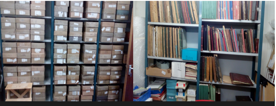
Some of the Archival Collections in An Daonchartlann, Loughlinstown.